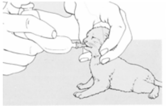
Figure 2: The correct position for bottle feeding kittens or puppies

Hand feeding can be challenging and yet, very rewarding. Every one who has done this has developed a method that works best for them; you will too! Whether you use a baby animal bottle or a syringe, it's best to keep the kitten in a position similar to what they'd experience, if mama were there. In other words, don't turn the baby on his/her back. Keep the bottle at a 45-degree angle to reduce the amount of air getting into the kitten's stomach.